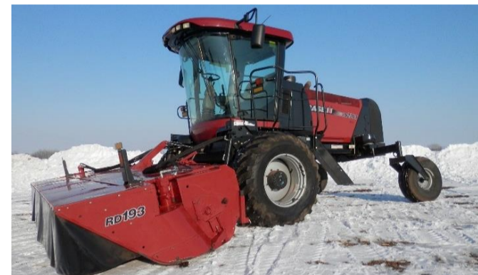
CIH WD2303 Discbine , RD 193 cutting platform, new knives, Buddy Seat in a clean cab, rear axle air suspension. 1136 hrs. & very clean.

Selling alongside is an interchangeable 15' JD culti-packer . A clean machine!