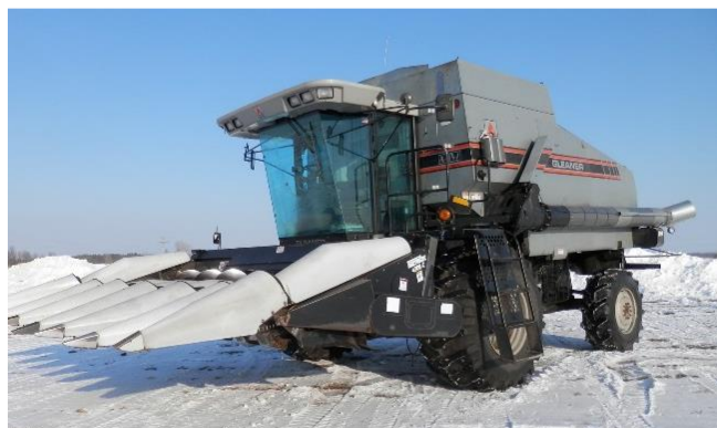
Gleaner R62 Combine , RWA, Cummin's powered, NEW 30.5L-30 drive rubber, new auger tube, spreader & divertor, and more. Always shedded & real clean with 4400 engine & 3258 separator hrs. Heads sold separate & in pkg. Harvestec 4306C 6RN CH , hyd. deck plates; Gleaner 20' flex platform , Air Reel, & brand new poly pan kit.

Bid Live or Online simulcast at Bidspotter.com