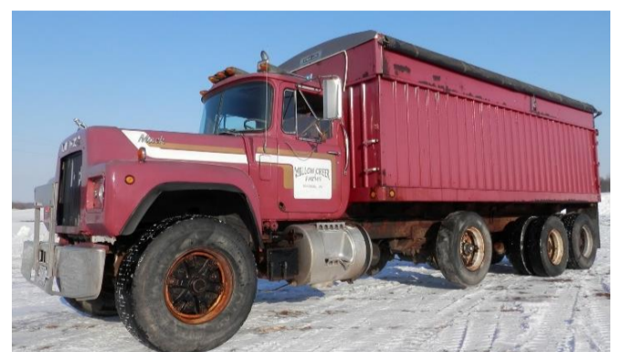
'83 MACK 283 Grain Truck , 10-spd. Fuller, tandem dually with lifter, sells with 20' all steel high lift box, dual combo door-- strong runner!