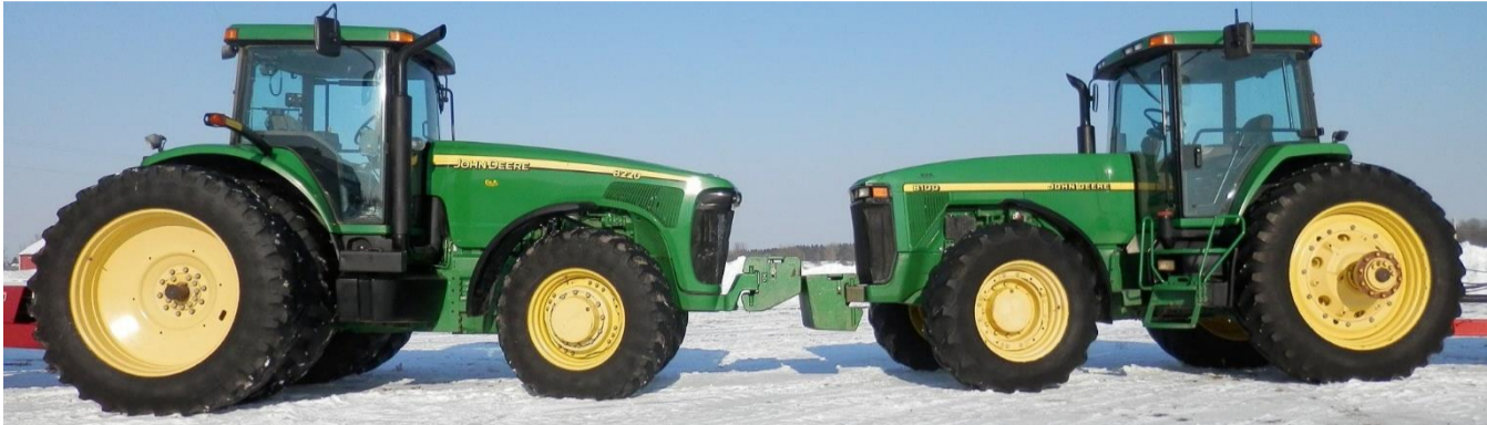
JD 8220 MFWD Tractor , Purchased new--18.4R-46 w/hub duals, 5 sets of remotes, inner rear weights, full rack of 20 suitcase weights, Greenstar ready, Quick hitch. Only 5600 hrs., a nice one-owner well-maintained Deere!

The Willow Creek Dairy herd includes...160 freestall, milking parlor cows and approx. a dozen springing heifers. Herd is 100% AI bred with Select Sires and has been on test for generations. 305 ME Lact. avg. over 23,000 with great components of 3.95 3.28 with cows selling @ 180 SCC. A herd that wears their udders well, with plenty of fancy to go along with milk & components. From the big 2-yr. old pen to many sound high production 3-yr. olds, the selection is great. While the facilities are older & tired, this well-cared-for herd of cows has plenty of room to grow as cows are not pushed. Breeding is right on schedule with a great selection of bred back cows selling. The herd has been culled hard recently and DHI production info will be recent & up to date. All cows have sire and maternal grandsire ID's. Be sure to check the web for coming picture proof of the Willow Creek cows!