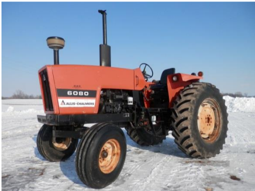
AC 6080 Platform Tractor , DR, 540, 3 pt., approx. 800 hrs. on OH--Straight!