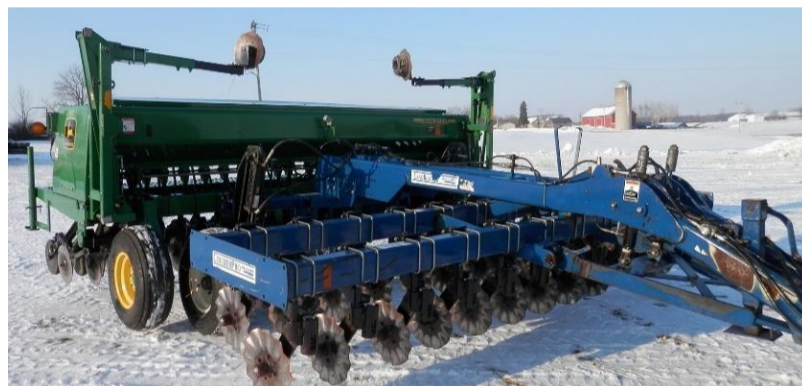
JD 1520 15' No Till Drill , rear grass, marker arms, lights & paired to a 4-wheel Blu Jet Land Tracker Coulter Pro Coulter Cart.

Selling alongside is an interchangeable 15' JD culti-packer . A clean machine!