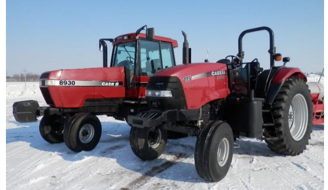
CIH 115 Maxxum platform tractor w/folding ROPS, purchased new, 16-Spd., Partial PS, 18.4R38's, 3-rib fronts, DR, front bracket. Clean & Sharp 1602 Hr. one-owner chore tractor.

Watch for lots of pictures & full listing at millernco.com & on FB