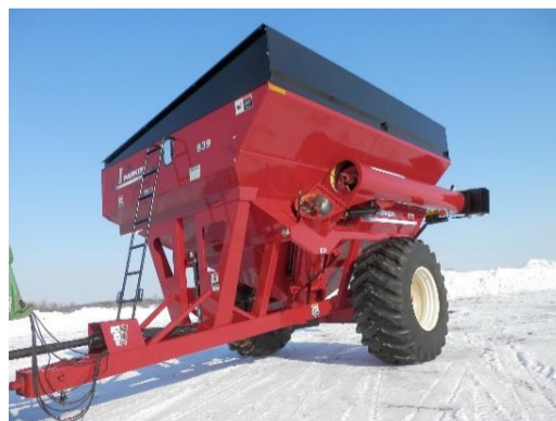
Parker 839 grain buggy , 850 bu., 30.5-32 FS Tractor grip tires, lights, site windows, auger deflector & light, ladder. Looks like new & hauls a big load!